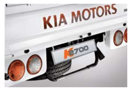
Rear license plate holder & step: Provides a convenient way to extend your reach when loading or unloading items.