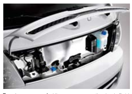
Front open panel: Allows you to easily check fluid levels and refill when necessary.