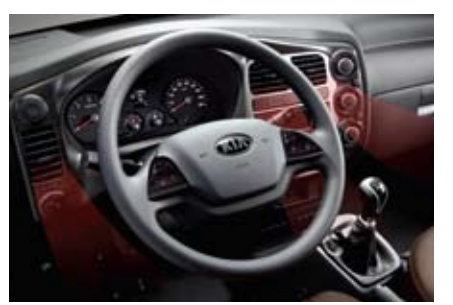
Heater: Rapidly warms the cabin on chilly days thanks to four separate vents.