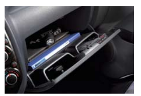
Glove box: Offers convenient storage solutions for small items while providing up to 11.13 litres of total space.