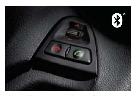
Bluetooth steering wheel controls: Enables use of your Bluetooth-enabled mobile phone for a safe journey.