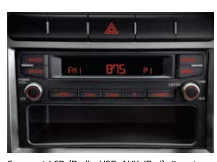
Segment LCD (Radio+USB+AUX+iPod): Experience enhanced audio using the Segment LCD screen