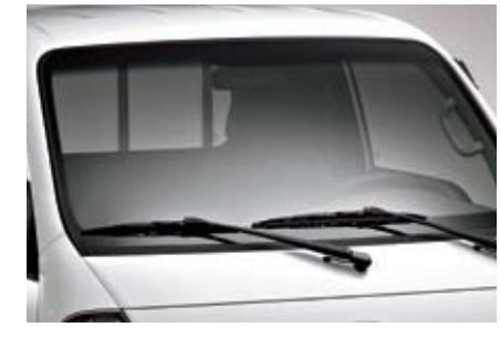
Tinted glass: Keeps the cabin temperature at a comfortable level when working in hot weather