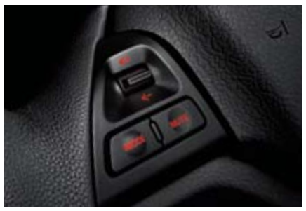
Steering wheel audio remote: Allows you to safely control a number of audio system functions without taking your eyes off the road.