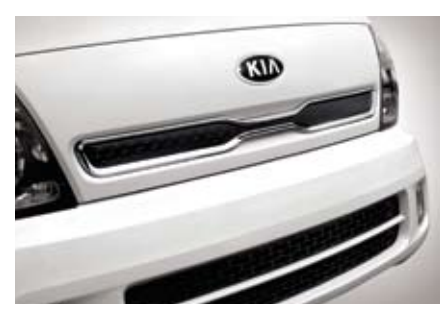
Hood with garnish: Features Kia's signature familylook grille and chrome accents to convey a subtle touch of luxury.