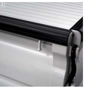
Enjoy Your Work K-series truck