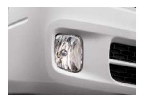
Front fog lamps: Ensure maximum visibility in foggy conditions so that you get the job done safely.