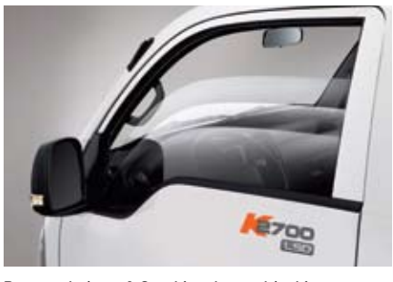
Power windows & Outside mirror with side repeater: Operate smoothly at the touch of a button mounted on the door armrest and OSR(Outside mirror with side repeater) is an option limited to the LHD countries within the general region.